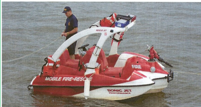
Mobile water rescue craft provided by the Mobile Fire department stands by.