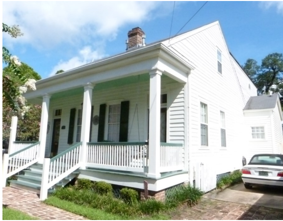
556 Eslava Street Phillip Davenporte Panatera-Davenporte, c. 1880

This Creole Cottage displays two front doors and an interior chimney.