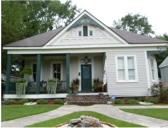
34 S. Lafayette Street Melanie Bunting Grove-Bunting-Seymour, 1924

A prominent central gable with bargeboard decoration and an inset porch define this early twentieth century house.