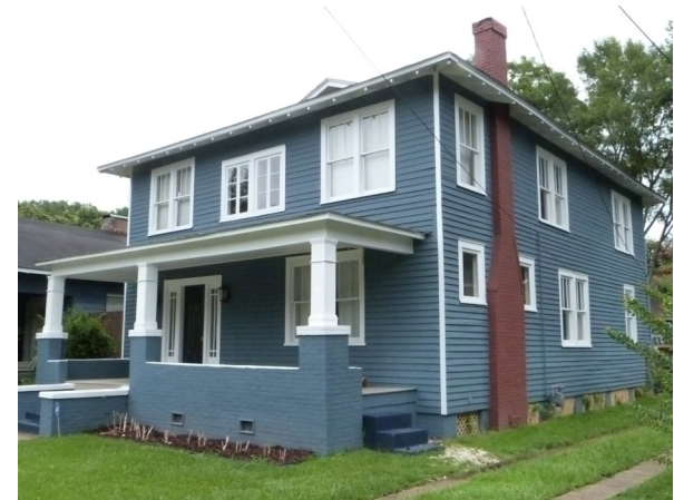
18 Semmes Avenue Melanie Bunting Arnold-Bunting-Seymour, 1928

This property features a gabled bay, attached wraparound porch and hip roof dormer.