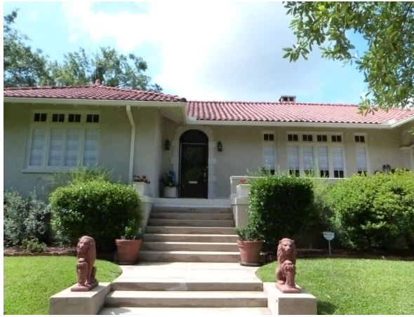
1563 Government Street George Bauer, 1926

This Mediterranean style house features exterior stucco and a red ceramic tile roof.