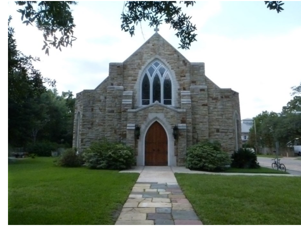
1419 Government Street First Christian Church, 1941

First Christian features a stone sanctuary and beautifully proportioned lancet windows and doors.