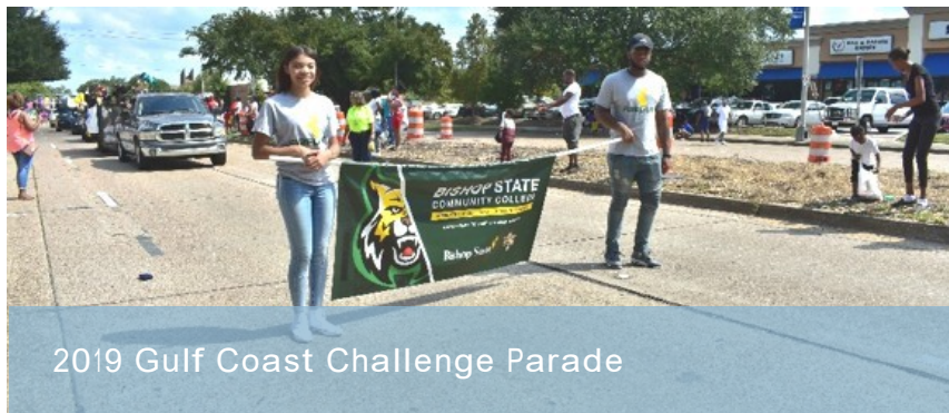
2019 Gulf Coast Challenge Parade