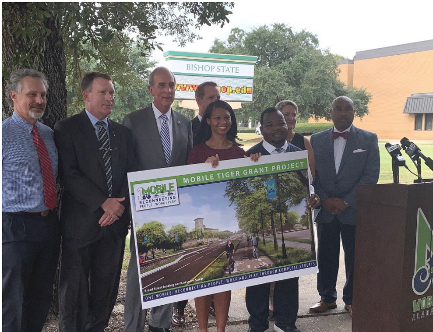
TIGER Project Ground Breaking

The TIGER Grant construction project (phases 1 and 2) that will transform sections of Broad and Beauregard as part of the One Mobile Initiative continues in earnest. Here are some photos depicting progress on the project to date.