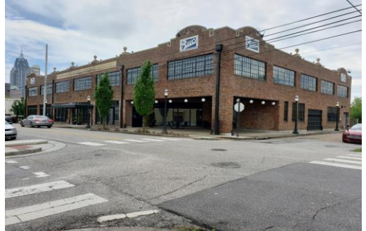
The Buick Building Mobile, AL