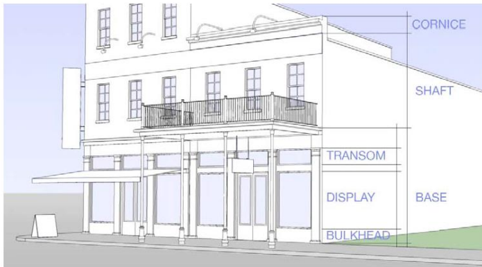
Figure A-10.1 Shopfront Elevation Elements

Cornice: Trim required at the eave or top of parapet. May include one or more habitable floors for buildings over 6 stories.