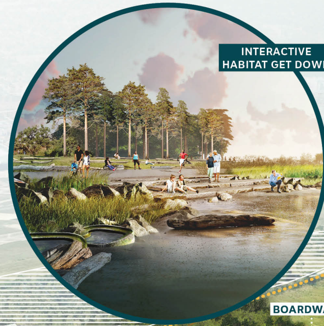
INTERACTIVE HABITAT GET DOWN